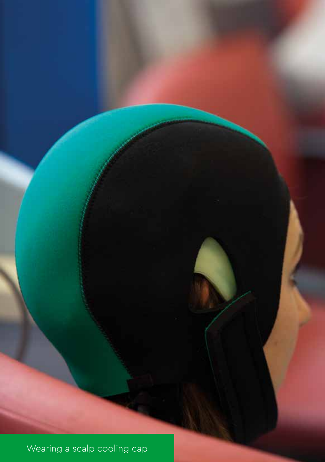
Wearing a scalp cooling cap